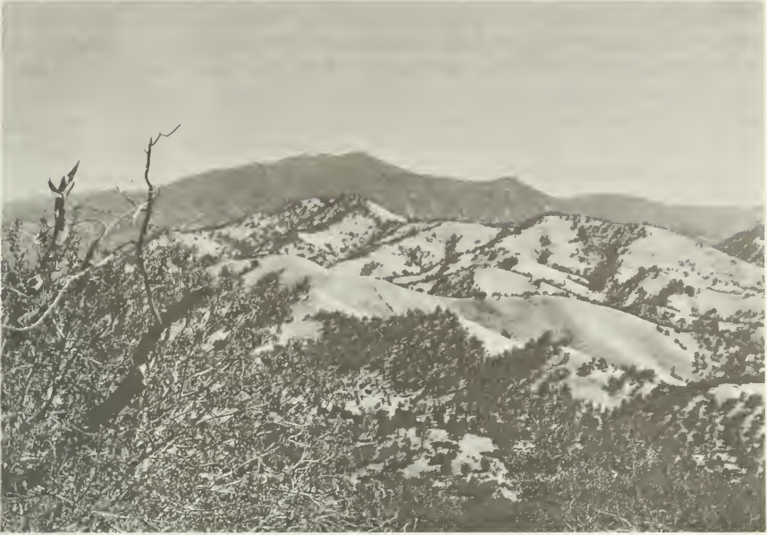
Fig. 8. Feeding habitat used by Sespe-Sierra nonbreeding condors.